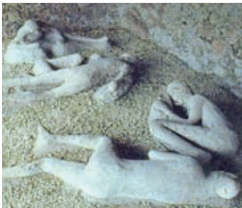
Excavations in Pompeii