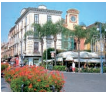
The historical centre of Sorrento