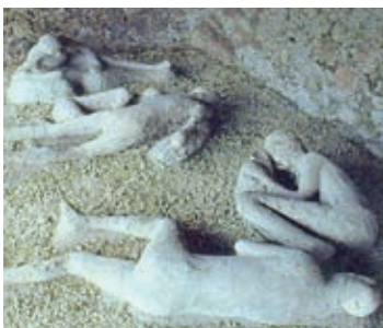
Excavations in Pompeii

Since then, its excavation has provided an extraordinarily detailed insight into the life of a thriving city at the height of the Roman Empire. During this guided visit you will see the past prosperity of the town through its ruins of Roman villas, bathhouses, and temples, which have now been unearthed; even an amphitheatre has been found. Today Pompeii is one of the most popular tourist attractions of Italy, with 3 million visitors in 2009, and it is a UNESCO World Heritage Site.