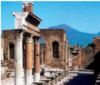
The historical town of Pompeii

After time to take in this amazing place, the tour travels back to Sorrento by coach for dinner at "Fattoria Terranova", a farmhouse style restaurant located on the hills above Sorrento, from which you can view both the Naples and Salerno Gulfs. Return to Sorrento by coach after dinner.