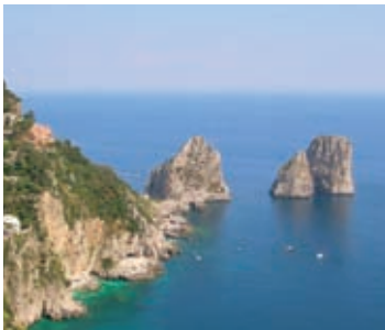
The Island of Capri

Includes coach transfer to the port and back, hydrofoil to Capri, coach transfer in Capri, entrance fees, English speaking guide and lunch