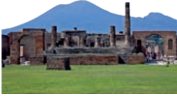
Pompeii with Mt. Vesuvius

Hilton Sorrento Palace Hotel Via s. Antonio 13 Sorrento, Italy 80067 Tel: +39 081 878 4141