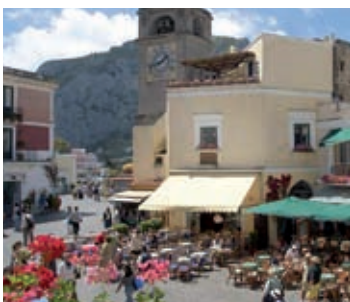
Capri's famous main square

Close to the gardens is the Charterhouse of St. Giacomo, founded in 1371 by Count Giacomo Arcucci, secretary to Queen Giovanna I of Naples. The monumental building marks an incomparable era in the traditional architecture of Capri. After lunch at a restaurant overlooking the sea, there will be free time to visit elegant boutiques, and stroll in the famous main square, symbol of the elegant and glamorous Capri before returning by hydrofoil again to Sorrento Port and on to hotels by coach.