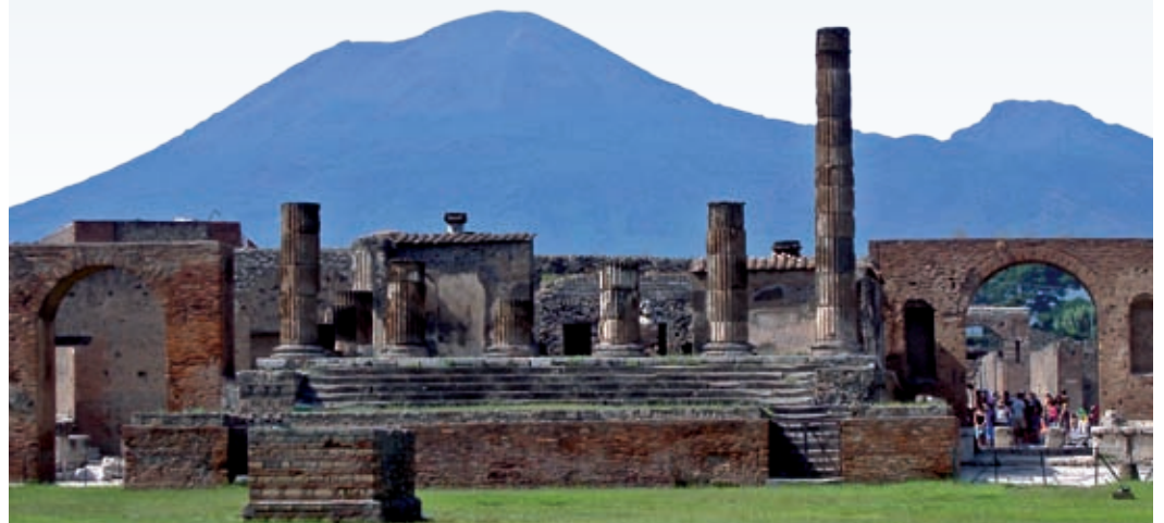
Pompeii with Mt Vesuvius in the background

Abstract submissions available online now at www.escp.eu.com